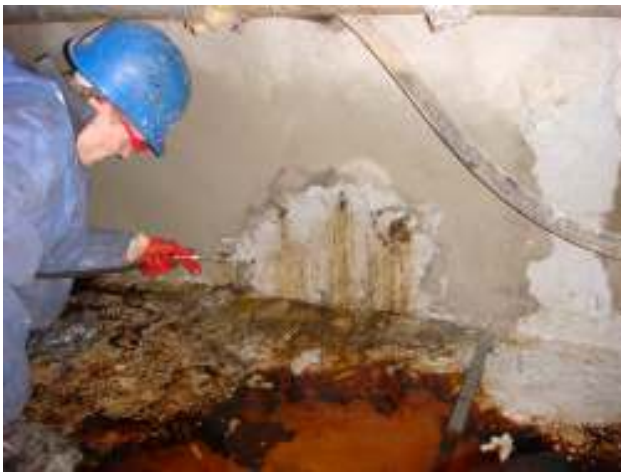
Water (and oil) leaking through the sub-grade wall. These had to be repaired in conjunction with the floor repair and clean-up operations.