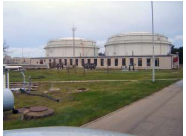
The project building in front of the tanks is the pumping facility for these tanks and where the first ORS treatment is to take place.