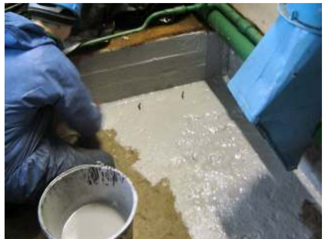
Here Eduards is applying the second coat of the ORS-C over the previously sanded ORS coating. This second coat was necessary to completely cover the area with no pinholes whatsoever.