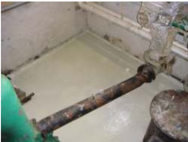
Finished ORS floor...