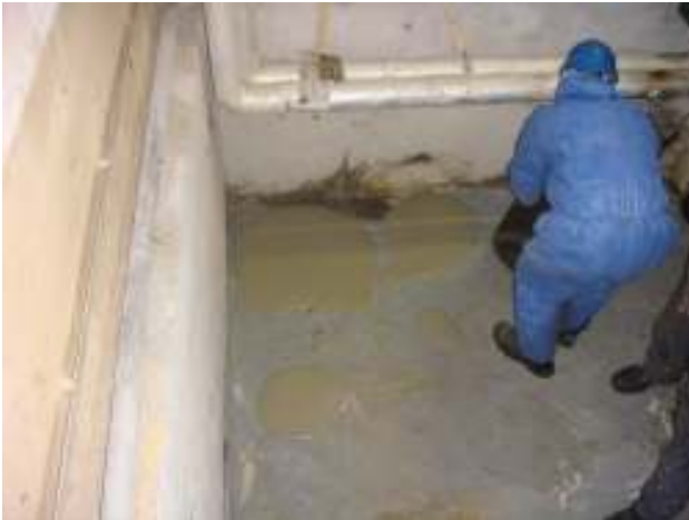
Gints starts application of the Koster (Germany) self leveling floor 15 underlayment products.