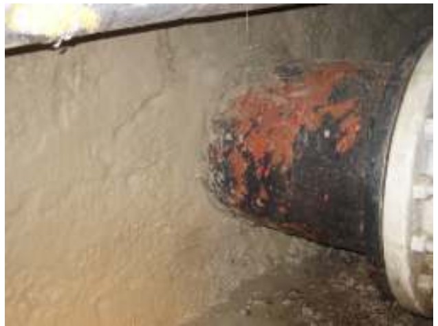
This is the same area after repairs are made with Koster (Germany- AG) waterproofing products