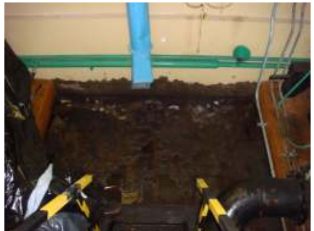
Floor before ORS.