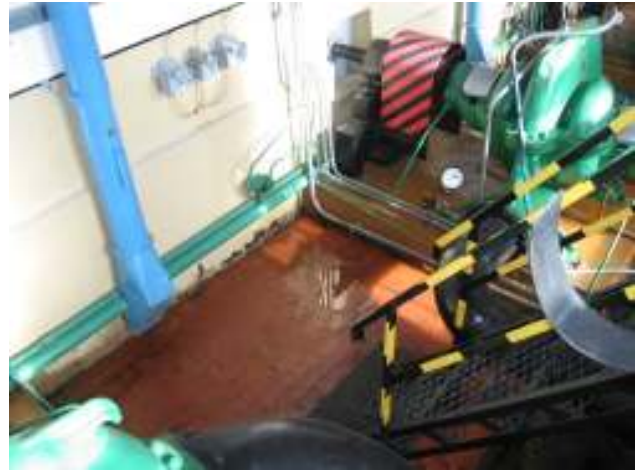
Looking from the catwalk to the lower area we see some of the water incursion on the lower wall. These pump stations are below grade and have both water and oil leakage problems.