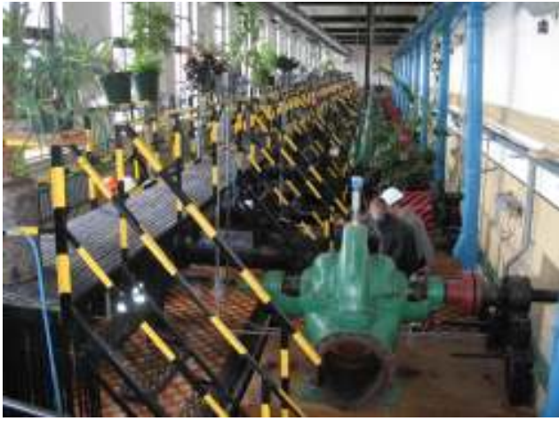
This shot is inside the pump station showing the raised catwalk (to the left with the plants) and the pumping machinery below to the right.