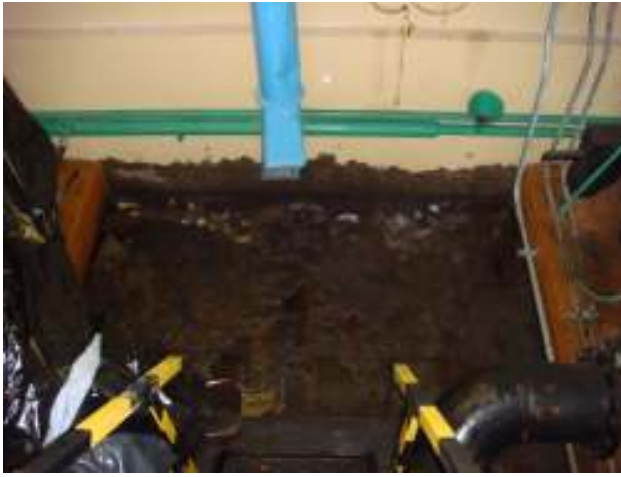
Prior to beginning the ORS treatment, all the tile has to be removed to expose the oil saturated concrete substrate.