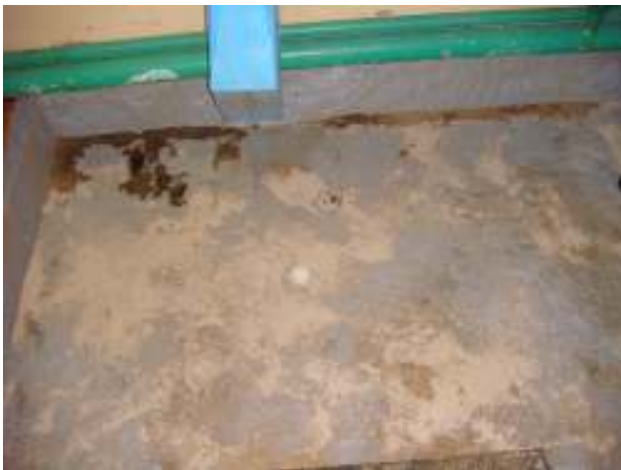
After much consideration it was decided to apply another coat of the ORS Epoxy. The area was cleaned with ORS-D and recoated and sand broadcast.