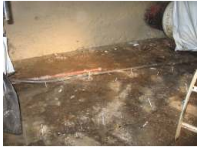
A shot showing the application of the bonding emulsion (a Koster product) to the coated substrate.