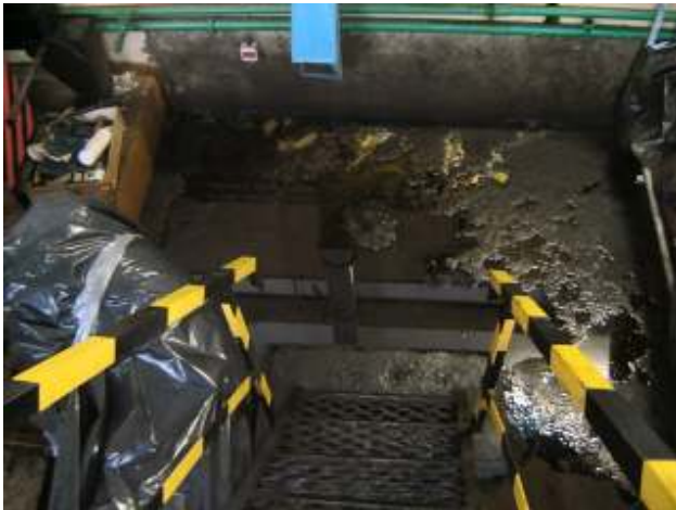
A before shot, compare to the finished floor on right.