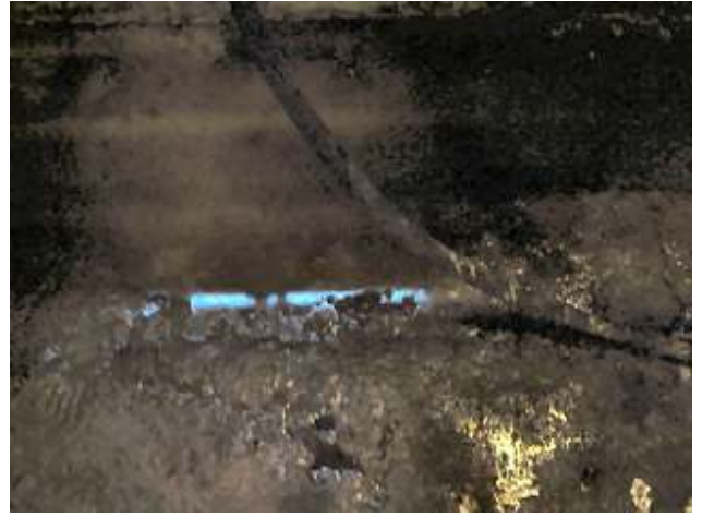
Some of the oily muck and debris under the tile and around the machines prior to cleaning.