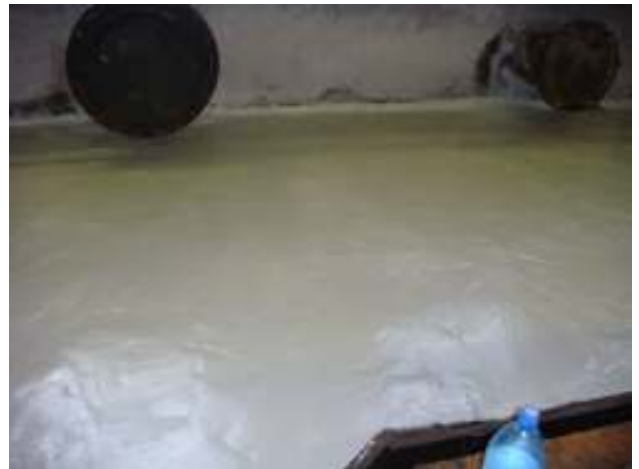
A shot of the final floor, compare to the photo of the oily floor on the left.