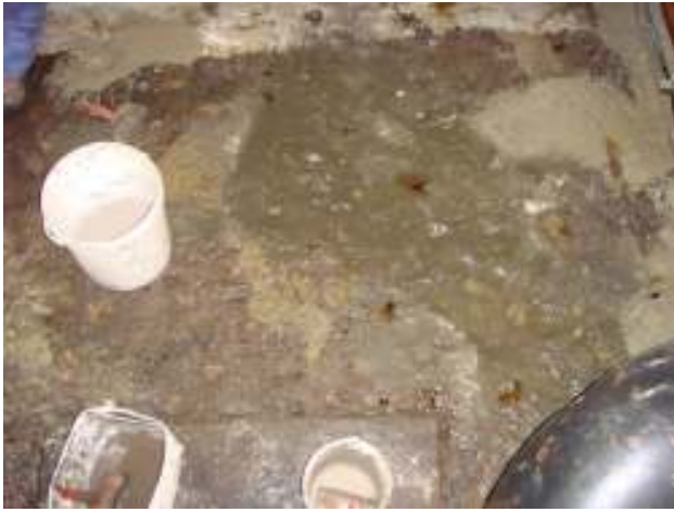
As this project continues, a bonding emulsion is applied to the cured ORS epoxy for added adhesion of the underlayment that will be applied next.