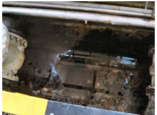
Another shot of oily water under and near a pump and piping.