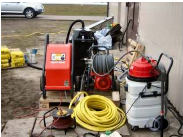
The equipment used for the ORS treatment located outside the pump station. The water heater and pressure washer are on the left, the vacuum on the right.