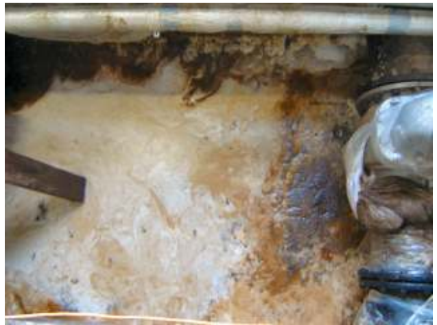
Again, more oil emerging from the substrate and the wall area.