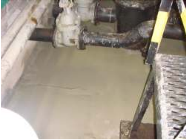
The underlayment being spread under the piping, the stairs to the catwalk are to the right.