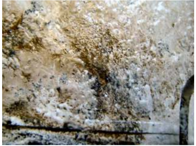
As per ORS application procedures, the foam is to soak for approximately one hour. Note the oil readily coming up out of the concrete.