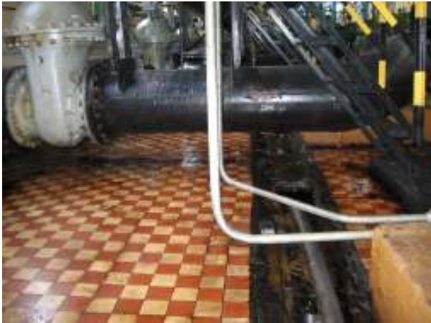
Now we are down in the lower pump area. Note the tile to the left and the trough on the right. Oil has leaked into this entire area.