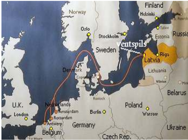
The general location of the Nafta Terminal in Ventspils, Republic of Latvia. The red line represents the major supply routes to Nafta.