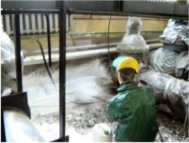
Gints continues to spray the ORS-D foam, note the plastic wrapped machinery. Both the walls and floor were treated.