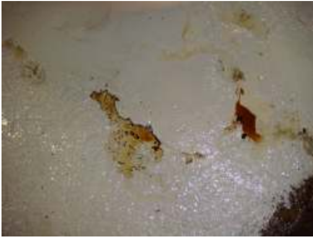
After the first coat is cured there are pin holes in the coating and oil is being squeezed up and on the coating.