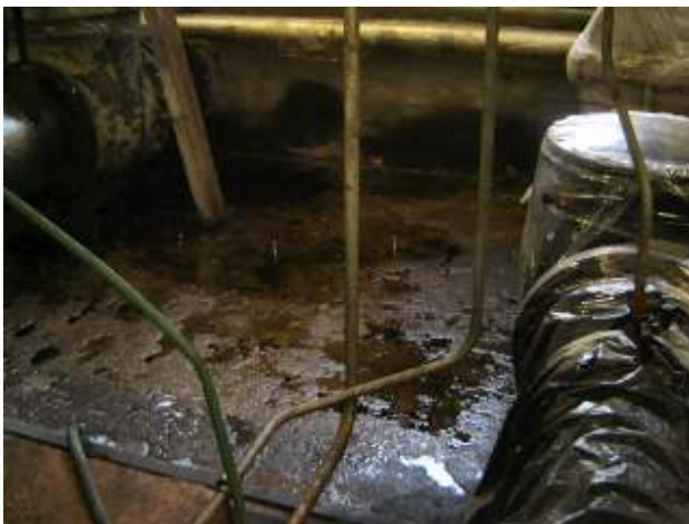
This water and oil incursion in these pumping stations has been a long standing problem and one that an environmentally aware company such as Nafta wants solved!