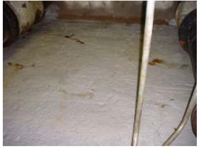
Various oil incursions around the floor area. These are due to the pressure under slab from water and pin holes in the coating.