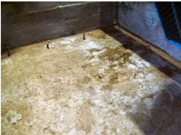
Cracks are then filled with the Koster KB-Pur injection system resin products. Koster Germany has many such waterproofing and injection products for a full range of repair work such as this.