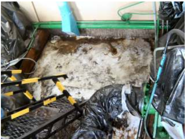
A general shot of the foamed area at the foot of the catwalk stairway. As the hour time limit nears, the foam will start to go from a white to clear. Again note covered machinery.