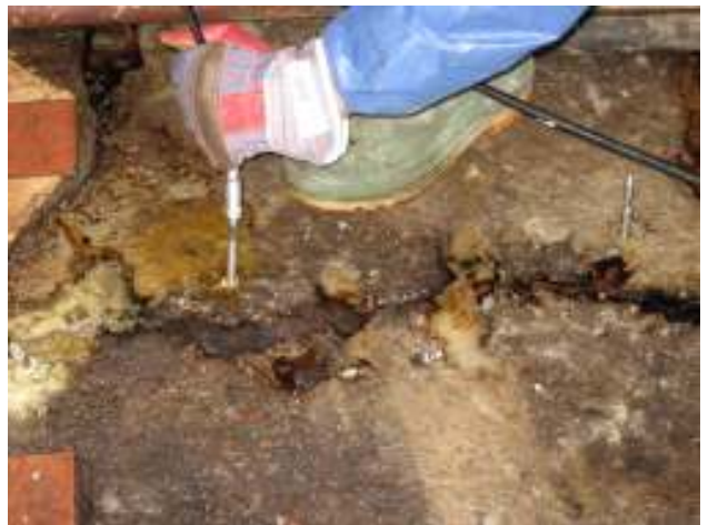
After cleaning and prior to coating, some large cracks have to be addressed. These are repaired using Koster crack filling materials. Note the injector pins and the pressure hose.