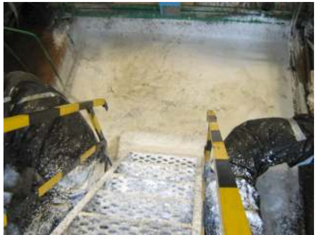
A second foaming is applied and let sit for approx. a half hour. Note the oil streaking in the left center of the white foam area.