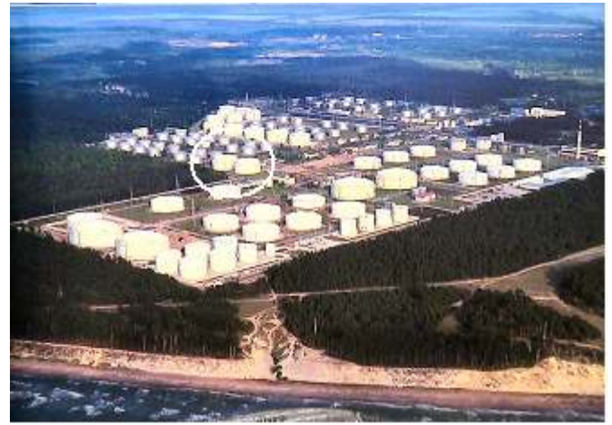
This is a view of the Nafta Terminal from the water-side. The white circle is the two tanks that are behind the ORS project site.