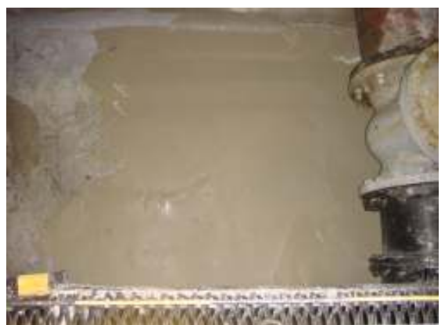
Another shot of the underlayment being applied under a pipe joint by the stairway.