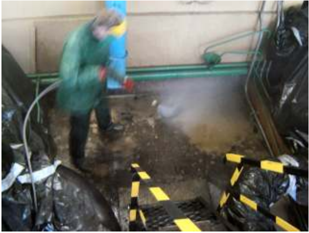
Gints continues to clean, note the clean substrate showing through!