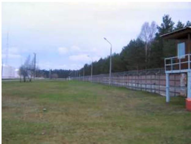
Because approx. 20% of all Russian oil production goes through this terminal and the high price of oil in Europe, security is a priority.