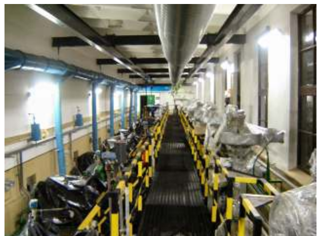
Pre-ORS treatment procedures, wrapping all sensitive equipment and machinery with plastic coverings. Note machines on left and right wrapped to prevent any water damage.