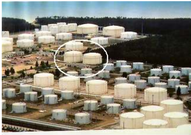
This view is looking from the land-side at the same two tanks as in the previous photo; the building in front is the pump station project site.