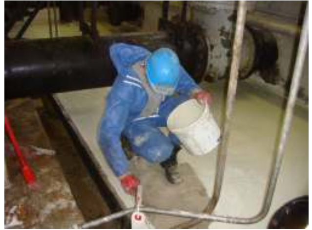
After the underlayment has cured the final top coat of epoxy is applied to the surface.