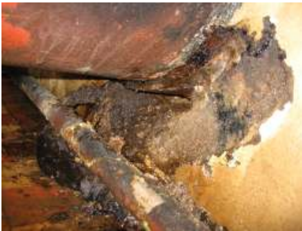
During and just prior to the cleaning operations, some of the leaking wall areas must be repaired. This is a pipe wall junction that has been leaking for quite some time.